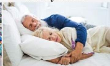
The ABCzzz's of Sleep