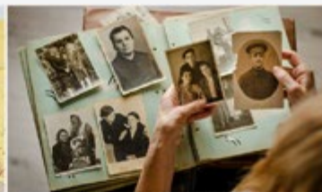
Preserving Our Family Stories