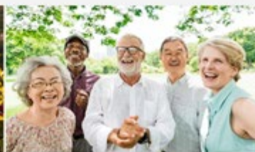
Our Aging Bodies