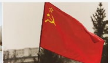
Lessons for a New Cold War