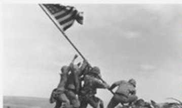
Uplcose and Personal in Iwo Jima