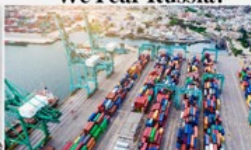
The Supply Chain Blues