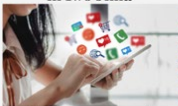
Digital Propaganda and Misinformation