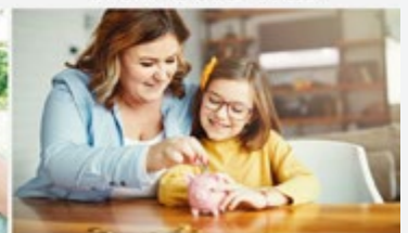
Cost Effective Wealth Transfer

MEMBER CONVERSATIONS are calls led by members. A topic is chosen, a member agrees to moderate and the conversation begins. Topics range from how do you invest to what will education look like for our grandchildren.