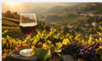
The Wonderful World of Wine